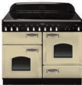
LEGACY 44 ELECTRIC COOKTOP CATHEDRAL DOORS